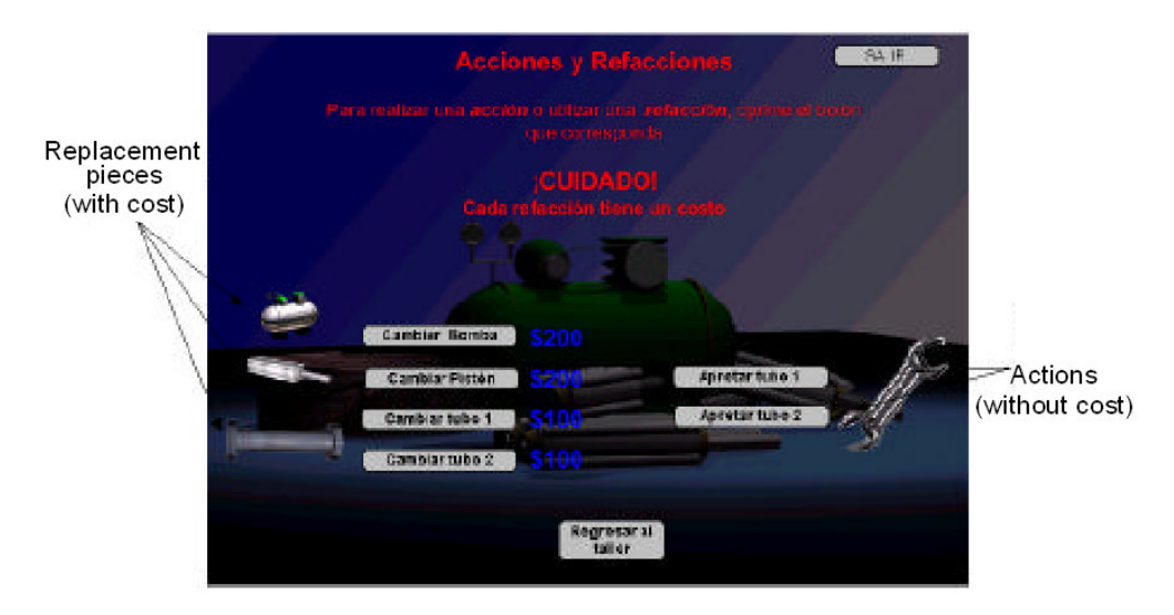
Figure 2. Screen of actions and replacement of the "Workshop of Mr. Nuts"

In the software, students play the roll of a technician who must attend clients, manage budgets, etc. The program presents a menu that allows the student to choose the practice on which he/she wants to work. However, the same problem can be presented by three different clients, each one of them with different expertise level. The program selects one of the clients randomly, so when a student decides to abandon a practice, the type of information that he/she will obtain the next time will not be the same.